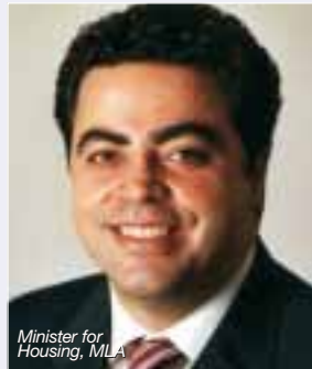
Minister for Housing, MLA

Westfields has a school motto which remains as appropriate now as it has been throughout our school's history - Fortitudo.