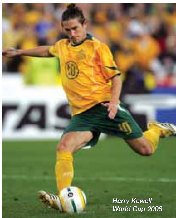
Harry Kewell World Cup 2006

Medical Centre Phone: 9604 3122 Gymnastics Hall Phone: 9604 3773 Sports Stadium Phone: 9604 9361