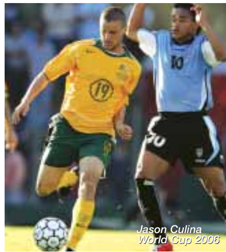
Jason Culina World Cup 2006