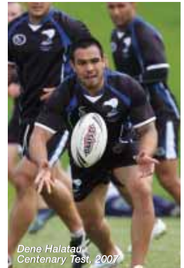
Dene Halatau Centenary Test, 2007