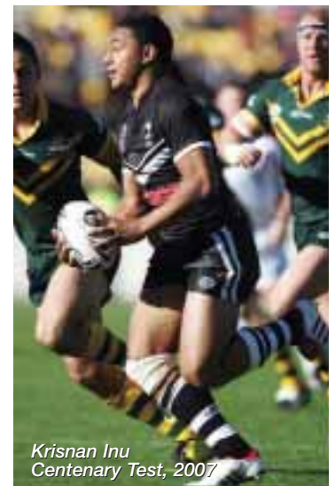
Krisnan Inu Centenary Test, 2007