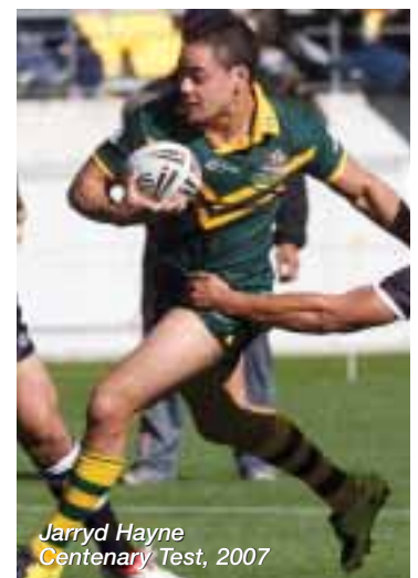
Jarryd Hayne Centenary Test, 2007