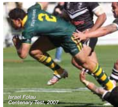
Israel Folau Centenary Test, 2007

Outstanding sports persons from Sydney, New South Wales, other states and overseas, are offered the opportunity to complete their primary and secondary education in a strongly supportive environment. The school has a strong academic and sporting tradition, a reputation for innovation and a staff committed to encouraging personal excellence. The philosophy of the school is to allow talented sports students to pursue their sporting dreams in partnership with their education. The successful development of the school rests on the outstanding work of dedicated staff, talented students and Parent Support Groups.