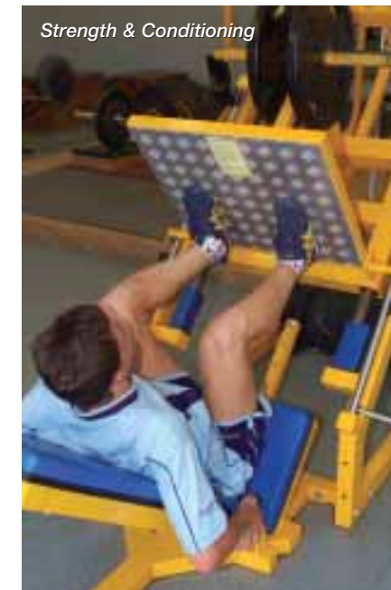
Strength & Conditioning